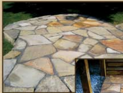
Examples of a stonescaped patio, walkway, and a dry-laid stone wall.